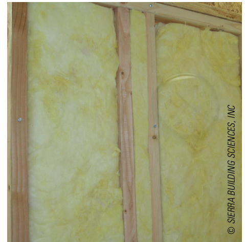
Correctly Sized Batts