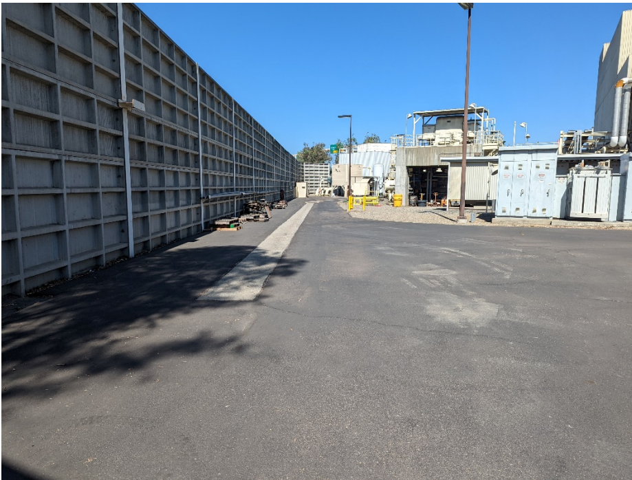
Photo 4: Existing conditions within Project site along the southern boundary. View west.