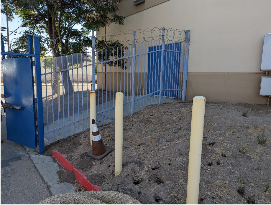
Photo 5: Existing conditions within Project site along the northern boundary. View northeast.