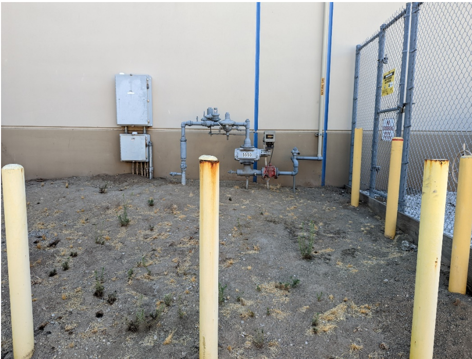
Photo 6: Existing conditions within Project site along the northern boundary. View southeast.