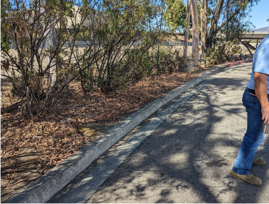
Photo 7: Existing conditions within Project site along the southern boundary. View west.