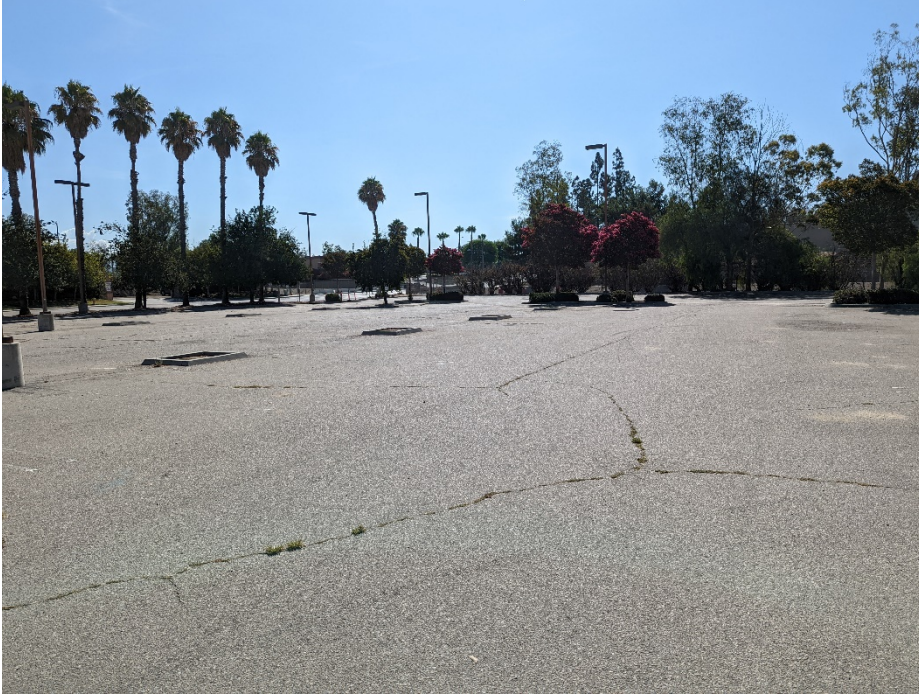
Photo 3: Existing conditions within Project site. View east-southeast.