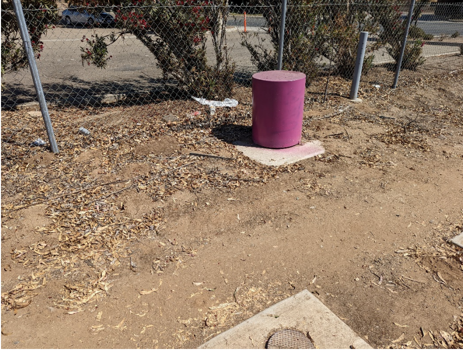
Photo 9: Existing conditions immediately outside Project site near eastern parcel corner. View north.