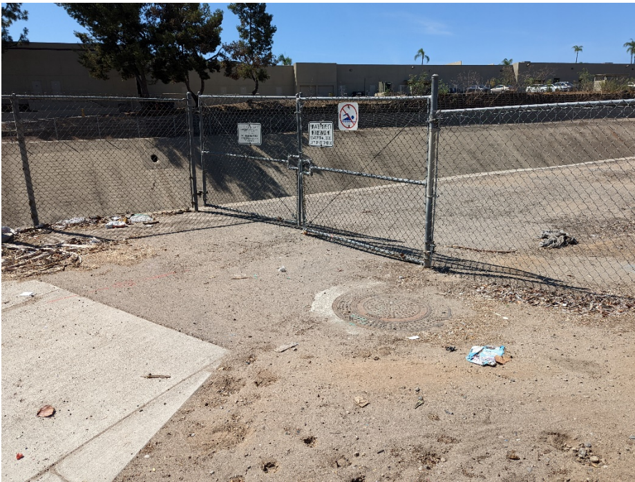
Photo 8: Existing conditions immediately outside Project site near eastern parcel corner. View south.