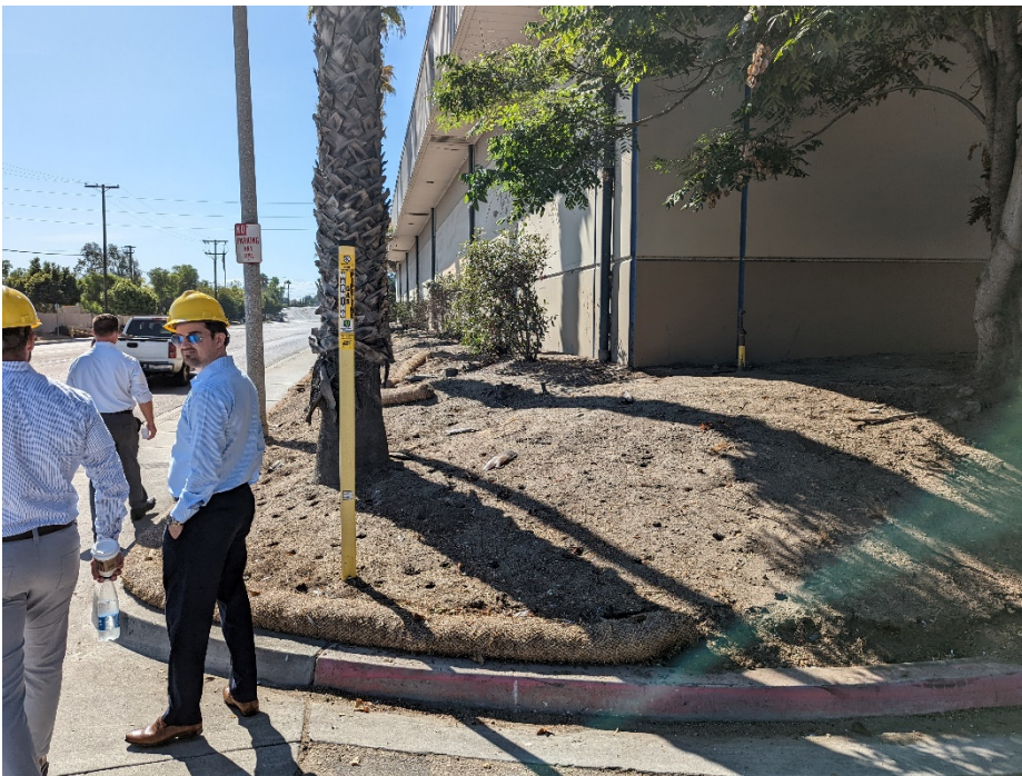
Photo 2: Existing conditions along Tulip Street from near the northern parcel corner. View southeast.